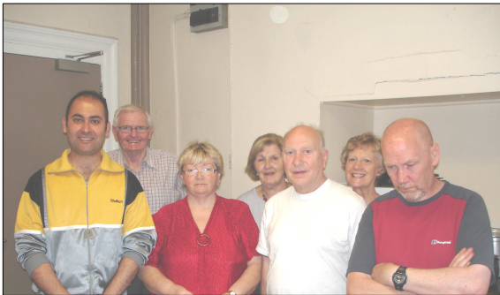
Some of catering team