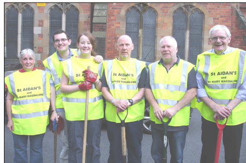
Some of the Acts of Random Kindness team