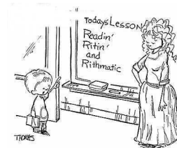
"What about spelling?"

It's easy to be an angel when no one ruffles your feathers.